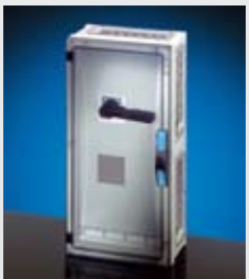
Isolator boxes with built-in switch disconnectors and MCCB circuit-breaker boxes

Enclosure walls can easily be closed via closing plate sets for use of single boxes