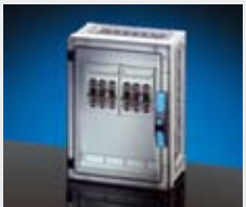
HRC fuse boxes with fuse switch disconnectors