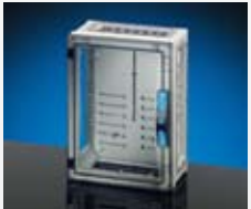
KWH meter boxes