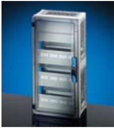
Circuit breaker boxes